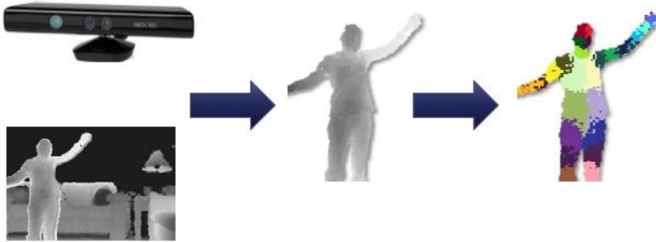
Object recognition (Kinect)