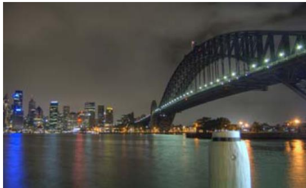
HDR (high dynamic range)